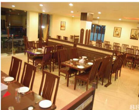
Restaurant and café