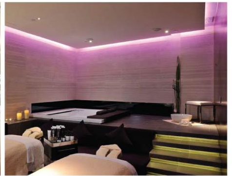
Unisex salon & spa