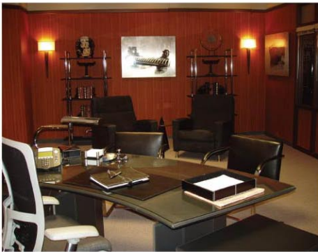
Doctor / lawyer's chamber