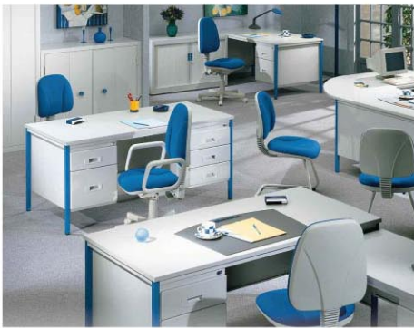
Small / medium office spaces